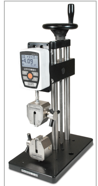
Shown with an ES20 test stand and G1061 wedge grips

Series 3 gauges include MESUR ® Lite data acquisition software, for tabulation of continuous or individual data points. One-click export to Excel button easily allows for further data manipulation.